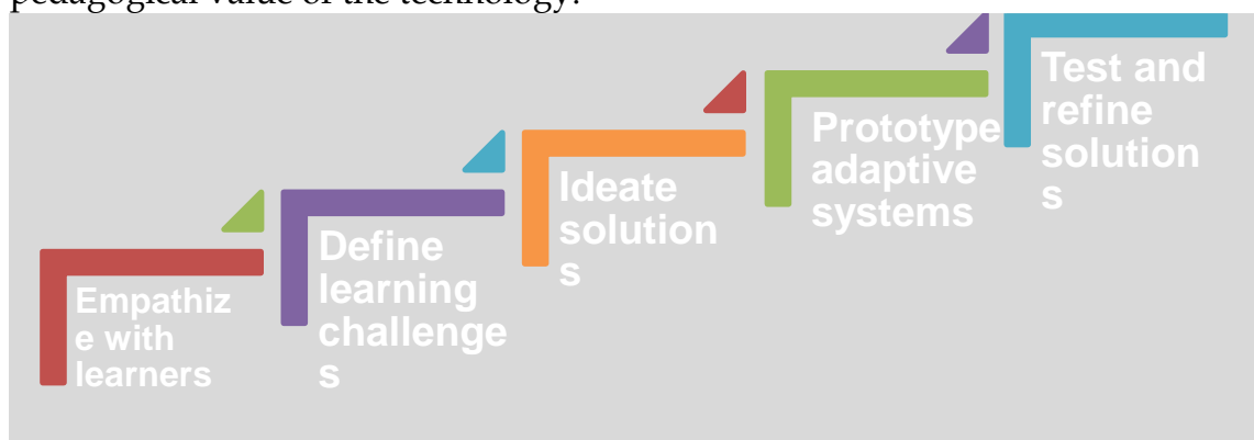
Figure 1. Design Thinking Process (Authors' generated illustration, 2025)

Testing closes the loop in the design thinking cycle and often leads back to earlier stages as new insights arise. Testing involves putting prototypes in front of real users, learners, teachers, or administrators and observing how they interact with them. The goal is not to validate a solution once and for all, but to learn from its strengths and shortcomings in the classroom. In adaptive learning, testing can be as simple as a week-long classroom pilot that measures how students respond to adaptive prompts or how teachers use the data generated by the system. Feedback collected through interviews, observations, and usage data informs the next iteration of the design. Some ideas will prove effective and be refined further, others will be discarded or reimaged. Over successive cycles, the solution becomes more aligned with learner needs and more robust in addressing the original problem. Testing also provides the evidence base for evaluating the impact of adaptive learning systems. Instead of focusing solely on algorithmic performance, testing highlights outcomes such as student engagement, teacher satisfaction, instructional efficiency, and learning gains, outcomes that reflect the broader pedagogical value of the technology.