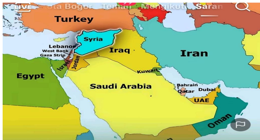
Figure: Iran's Territory Amid the Geopolitical Pressure of Surrounding Arab States. "

Nasr (2025), in Iran's Grand Strategy: A Political History , emphasizes that Iran's grand strategy has been shaped by a combination of foreign intervention, war, isolation, and the imperative to ensure state survival within a strategic environment perceived as threatening. Accordingly, Iran's security policy does not emerge from simple expansionist ambitions, but rather from a continuous pursuit of security, strategic autonomy, and political dignity.